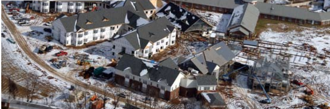
Construction on the Louisville Care Center continues on schedule. The rehabilitation center's exterior (forefront) and portico were finished with brick and siding in January.