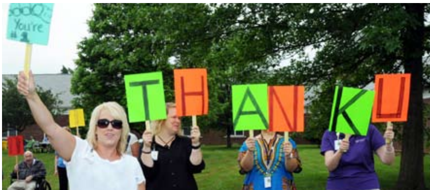
Louisville staff and residents hosted a cookout for the Care Center construction crew.