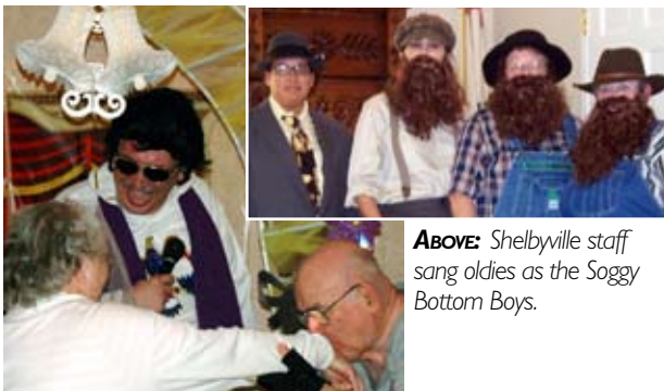
ABOVE: Shelbyville staff sang oldies as the Soggy Bottom Boys.