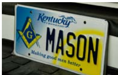
Kentucky Masons can purchase the specialized vehicle tag and make a donation to the Homes at the same time.