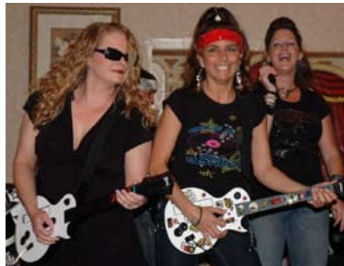
Louisville Rehab staff entertained residents as The Nighthawks.