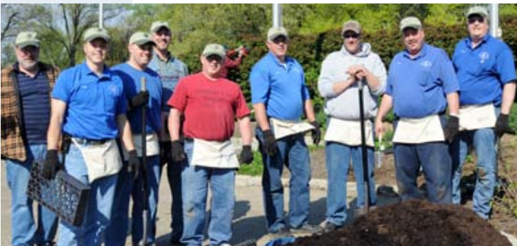
Above: Members of Pitman No. 124 and Preston No. 281 joined forces at the 2008 Great Day of Service.