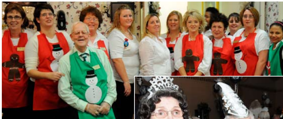
Above: Masonic Home of Shelbyville staff made sure residents and their families enjoyed holiday celebrations at the Home.